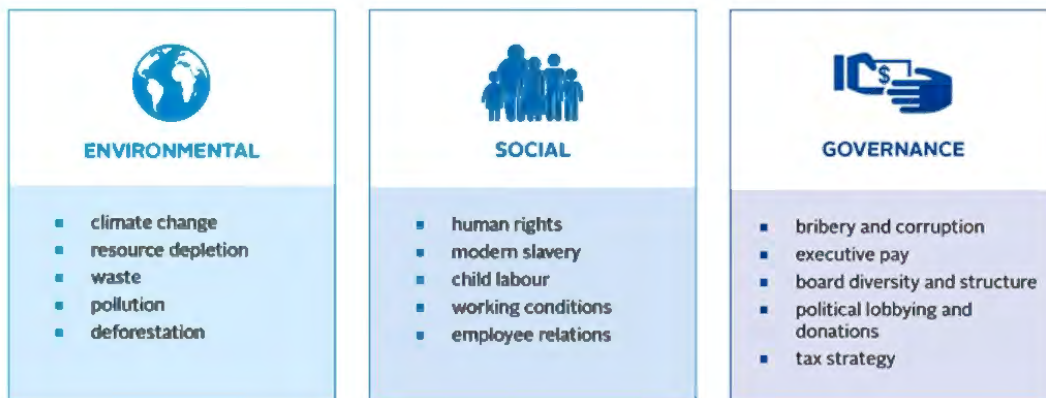
Table 1: PRI's ESG Framework

The United Nations Principles for Responsible Investment (PRI) is the world's leading proponent of responsible investment that supports its international network of investor signatories in incorporating Environmental, Social and Governance (ESG) factors into their investment and ownership decisions. Table 1 provides an overview of the PRI's framework: