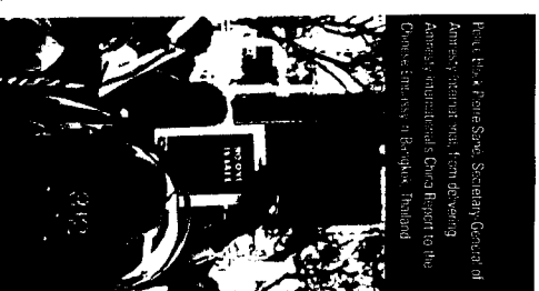
Photo by © Peter Stone, Secretary-General of Amnesty International's Global Project to the Chinese Embassy in Beijing, Thailand

Amnesty International supports programs that help people learn about their human rights and how to defend them. We take part in training programs for government officials and security personnel. We pressure governments to strengthen international human rights standards. We also join with other organizations to build community support for all the rights included in the Universal Declaration of Human Rights – the cornerstone of international human rights law.