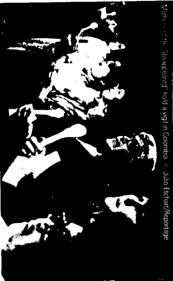
Members of the "disappeared" hold a vigil in Colombia.

Human rights activists are still being killed, tortured, imprisoned, and discriminated against.