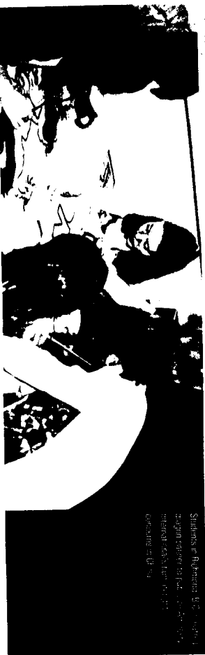
Students of the University of Toronto participate in a workshop on human rights.

Donations to Amnesty have helped free more than 43,000 prisoners of conscience. Donations make possible our fact-finding, reporting and public awareness activities. They sustain our global Urgent Action Network. They help promote human rights awareness and activism among young people across Canada. And they support Amnesty International programs to strengthen