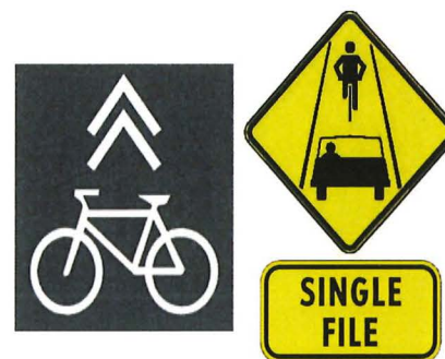
Figure 2: Sharrow Pavement Marking and Single File Signage

Consistent with other cycling-related signage and pavement markings on Sea Island roadways, “sharrow” pavement markings (i.e., bike stencil with two chevrons) and associated “Single File” signage were installed along the entire length of Ferguson Road west of McDonald Road (Figure 2). The City completed installation of the signage along its section in October 2020; the markings will be installed by the first quarter of 2021. Installation of signage and markings within the VAA and Metro Vancouver sections was completed in November 2020.