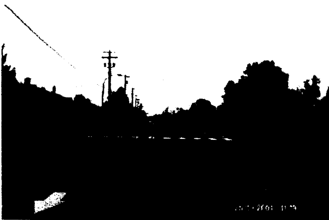
Type 5: Shoulder-mounted Signs