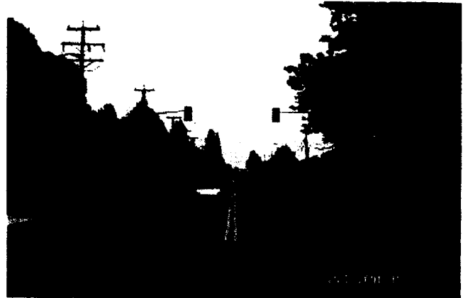
Type 2: Pedestrian Signal