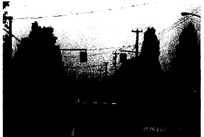
Type 4: Overhead Signs (no illumination or flashers)