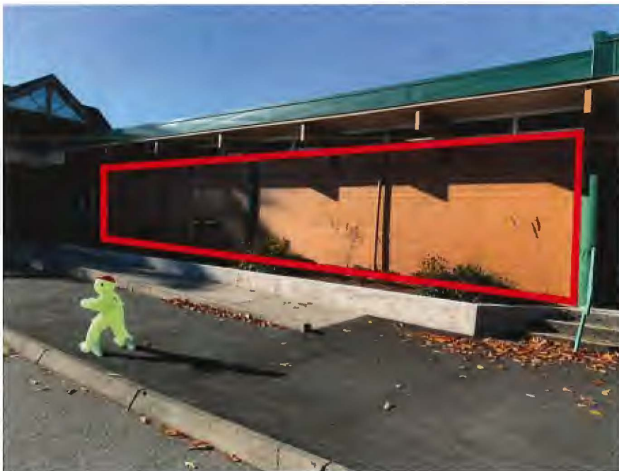
Proposed mural wall at Westwind Elementary School (approx. 350 square feet)