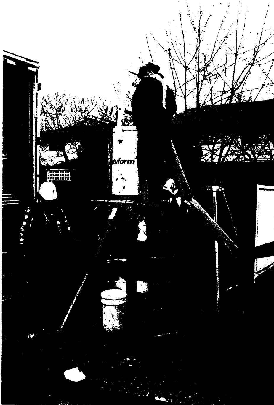
Installation of new sewer pipe lining via manhole.