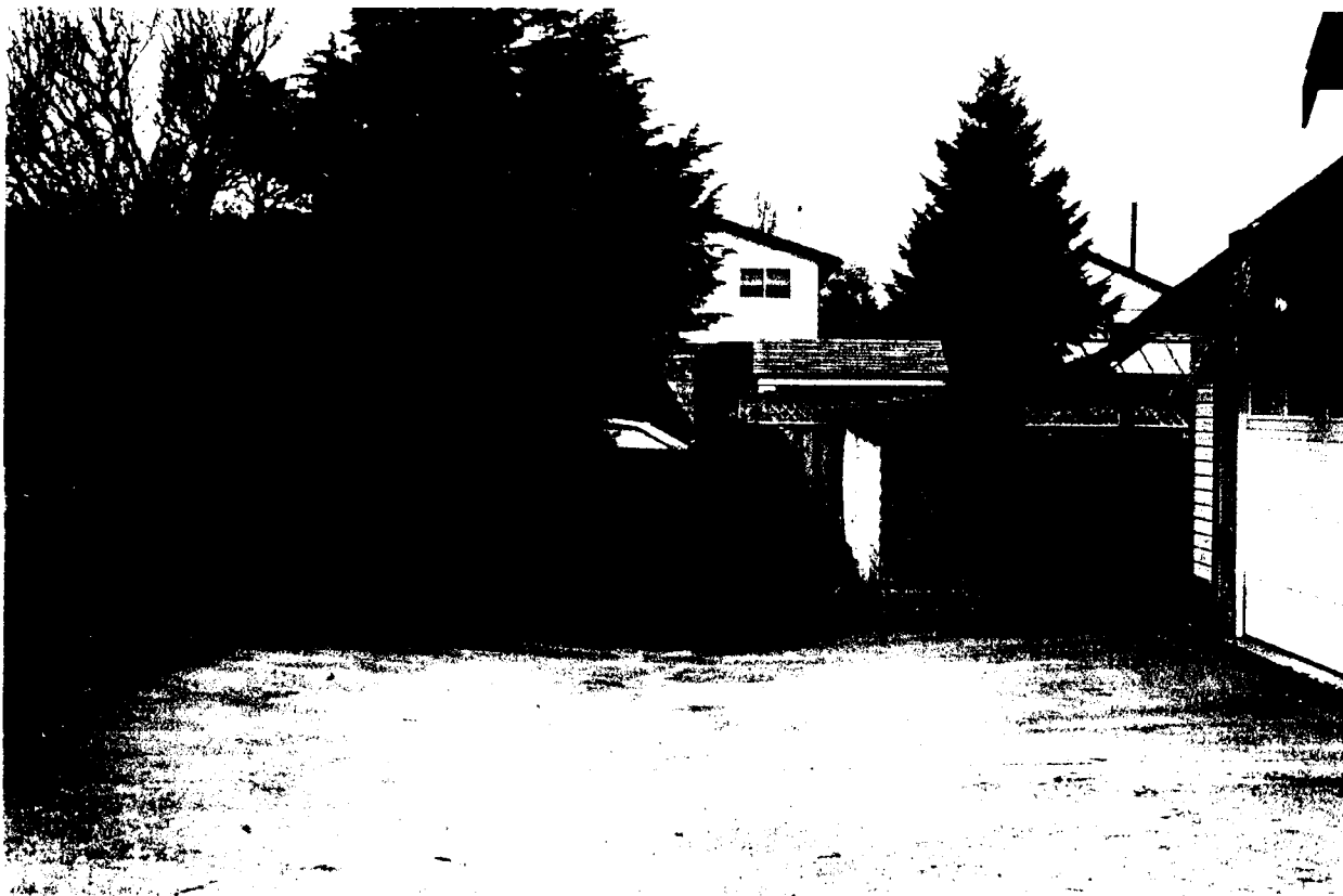
Existing structures built along right-of-way above sewer which was repaired using liner pipe installed by trenchless technology.