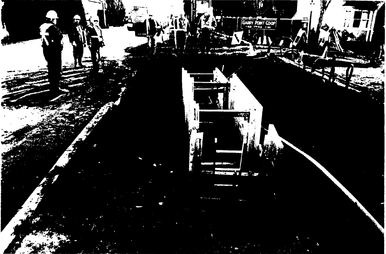
Conventional open cut sewer point repair.