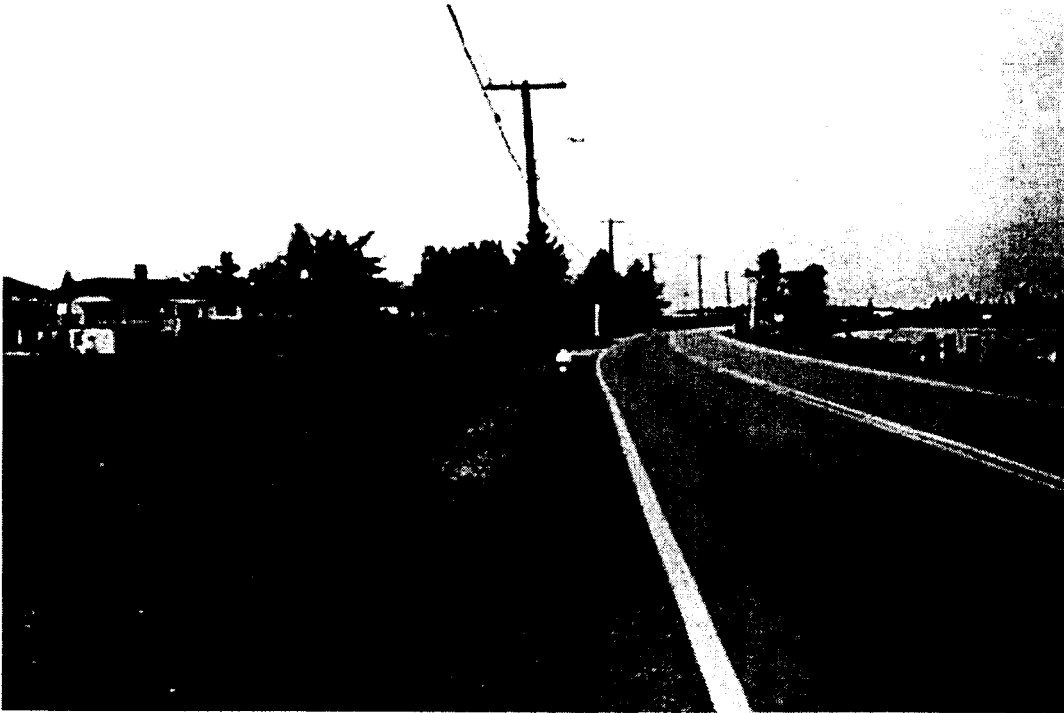
Looking West from Pump Station