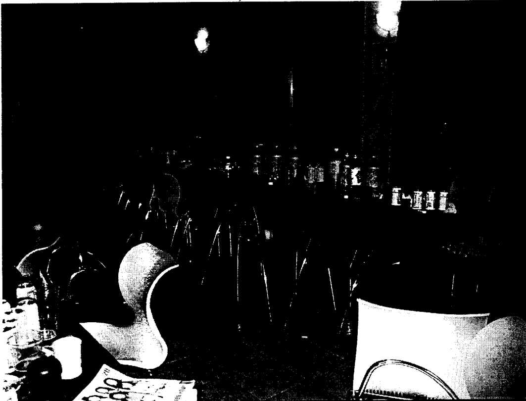
Fish Tank Tea House- Cont. Date: 05-01-30