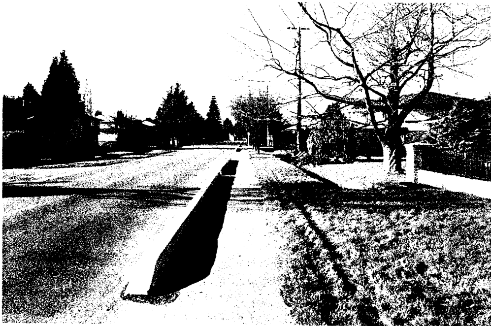
EXAMPLE OF SIMILAR WALKWAY(SAUNDERS ROAD)

EXISTING CONDITIONS ON PACEMORE AVENUE AND A SIMILAR WALKWAY ON SAUNDERS ROAD