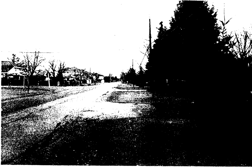
PACEMORE ROAD (EXISTING CONDITION)