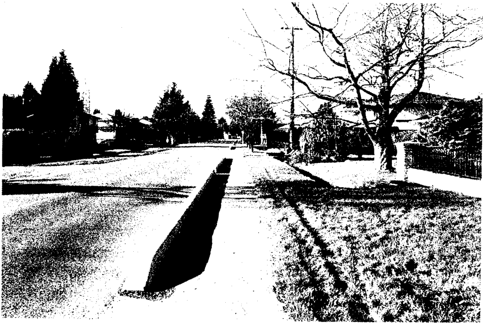
EXAMPLE OF SIMILAR WALKWAY(SAUNDERS ROAD)

EXISTING CONDITIONS ON PACEMORE AVENUE AND A SIMILAR WALKWAY ON SAUNDERS ROAD