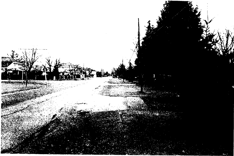
PACEMORE ROAD (EXISTING CONDITION)